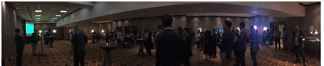
Gala Reception & Award Ceremony

3 Minute thesis competition: The room was full of attendees and audiences. Attendees received very good feedbacks for this session.