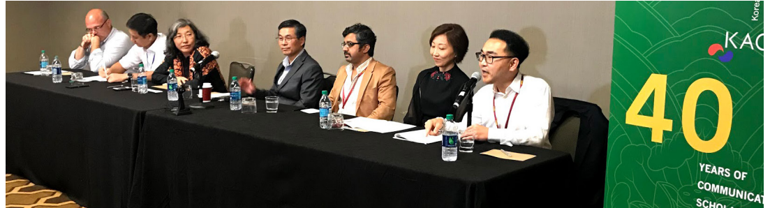
Final Plenary: The Past, Present, and Future of Asian Communication Research

We had four panel sessions and two research sessions. They dealt with topics including computation, algorithm, or big data analysis in communication, Korean wave, democracy, Korean press, and gender sensibility issues.