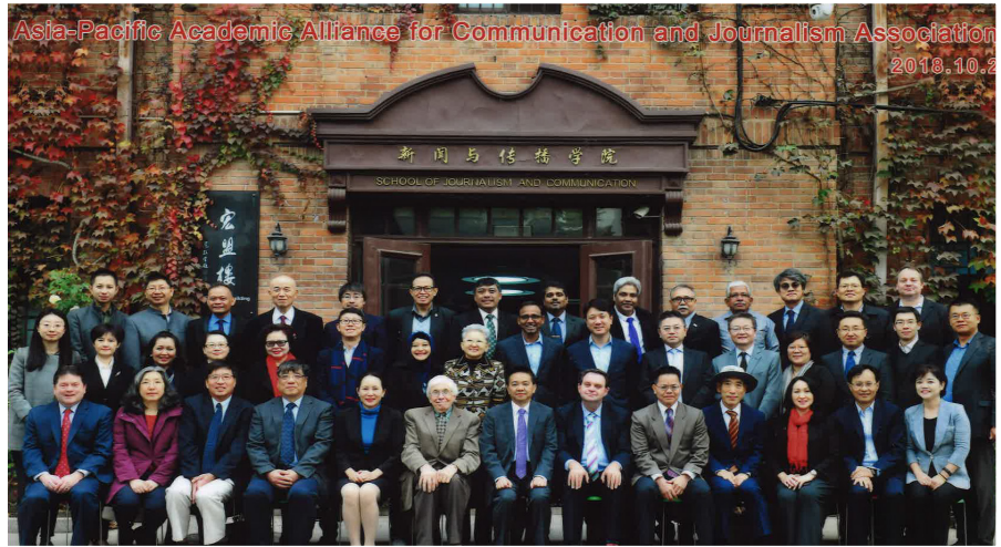
Asian Pacific Communication Alliance (APCA) Tsinghua University in Beijing, China on October 25, 2018.