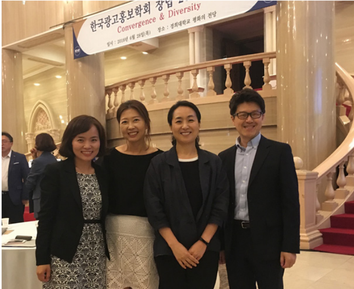
KACA's joint session with KADPR Kyunghee University in June 28, 2018.

KACA's newly-formed Global Outreach Committee (ad-hoc) has been busy at work to strengthen ties between KACA and other academic associations on the globe.