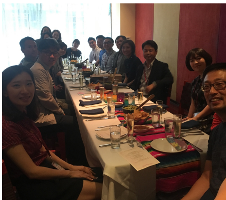
Post final plenary social