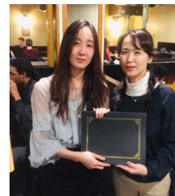
Top Faculty Paper Award