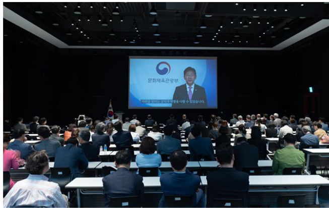
KSJCS 60th annual conference