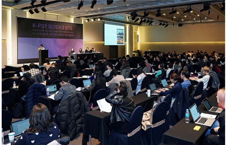
K-Pop Beyond BTS

On that day, I presented my ongoing research regarding the technological and cultural implications of the BTS phenomenon, looking at how networking logistics have restructured and capitalized human interactions and how the power of cultural flows has placed Korean pop groups at the center of the global pop music industry. We have seen that Korean media—film, pop music, online gaming, and television series—have collaboratively produced an unprecedented global sensation in the past decade. In response, several media and communication scholars have examined the alternative form of global culture and practice. Nevertheless, it still needs to be more thoroughly discussed in the context of cultural globalization. In this view, “K-Pop beyond BTS” was an insightful and inspiring academic gathering that not only enriched debate among academics but that also developed a constructive relationship between academic associations and media industries.