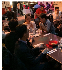
Graduate students Social Gathering/Lunch