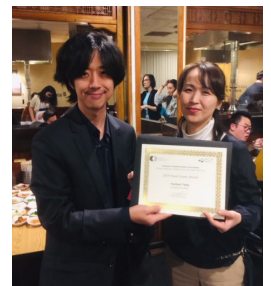
Travel Grant Award