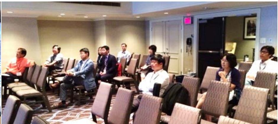
2014 AEJMC-KACA Research Session