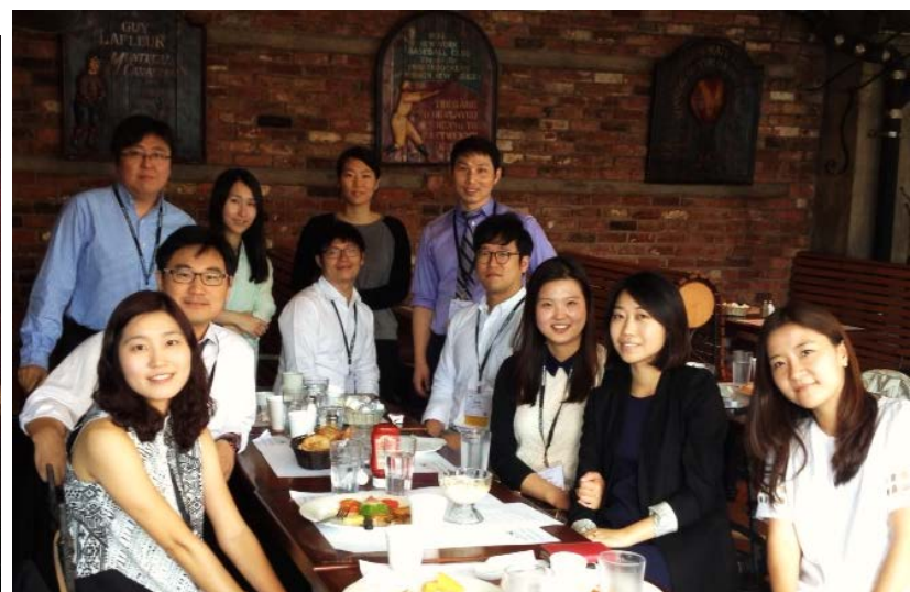
Graduate Student Social Lunch Gathering